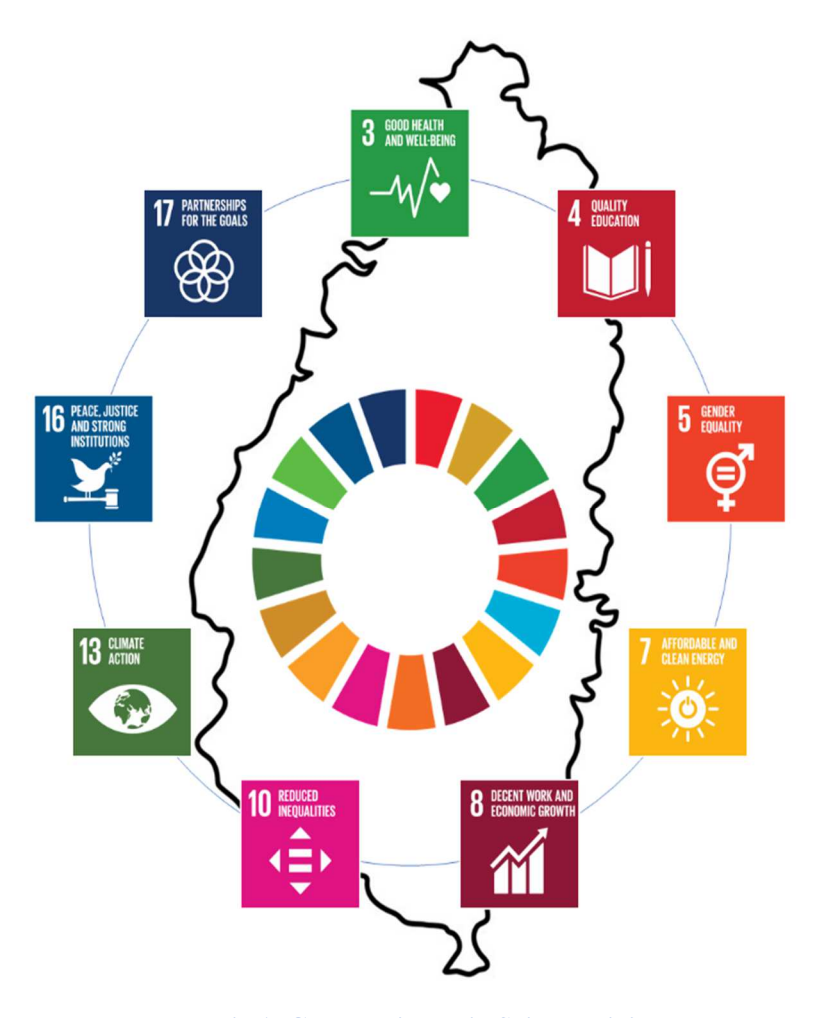
Fig 1: Goals reviewed in Saint Lucia's VNR report

The goals selected for review were endorsed at a national stakeholder consultation and they represent those goals under review at the HLPF 2019, and those that align with Saint Lucia's Medium Term Development Strategy. They also include some of the priority goals identified by Civil Society and the Private Sector in Saint Lucia.