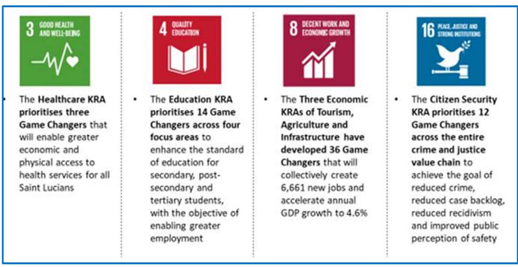
Fig 3: Alignment of the MTDS Six Key Result areas with the SDGs

In April 2018, the Government of Saint Lucia embarked on an inclusive and strategic process to develop the country's Medium-Term Development Strategy (MTDS) 2019-2022. The Prime Minister and his Cabinet produced outputs which formed the basis of the work programme of consultative economic and social Labs. The Labs, which functioned as idea incubators, facilitated interactive discussions between participants from 134 organizations representing the full spectrum of relevant stakeholders, from the public and private sectors, and civil society, and was conducted over the course of a month. They engaged in an iterative process of issue prioritization and the development of solutions based and actionable implementation programmes, with associated goals and targets around six Key Results Areas (KRAs).