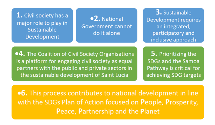
Fig 2: Key Messages from the CSO Consultation

The top three goals identified are as follows: